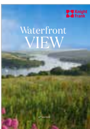
UK Waterfront View 2018 – 2018