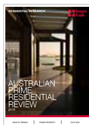
Australian Prime Residential Review – 2018