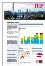
London Riverside Market Insight – 2018