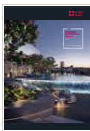
Global Branded Residences – 2019