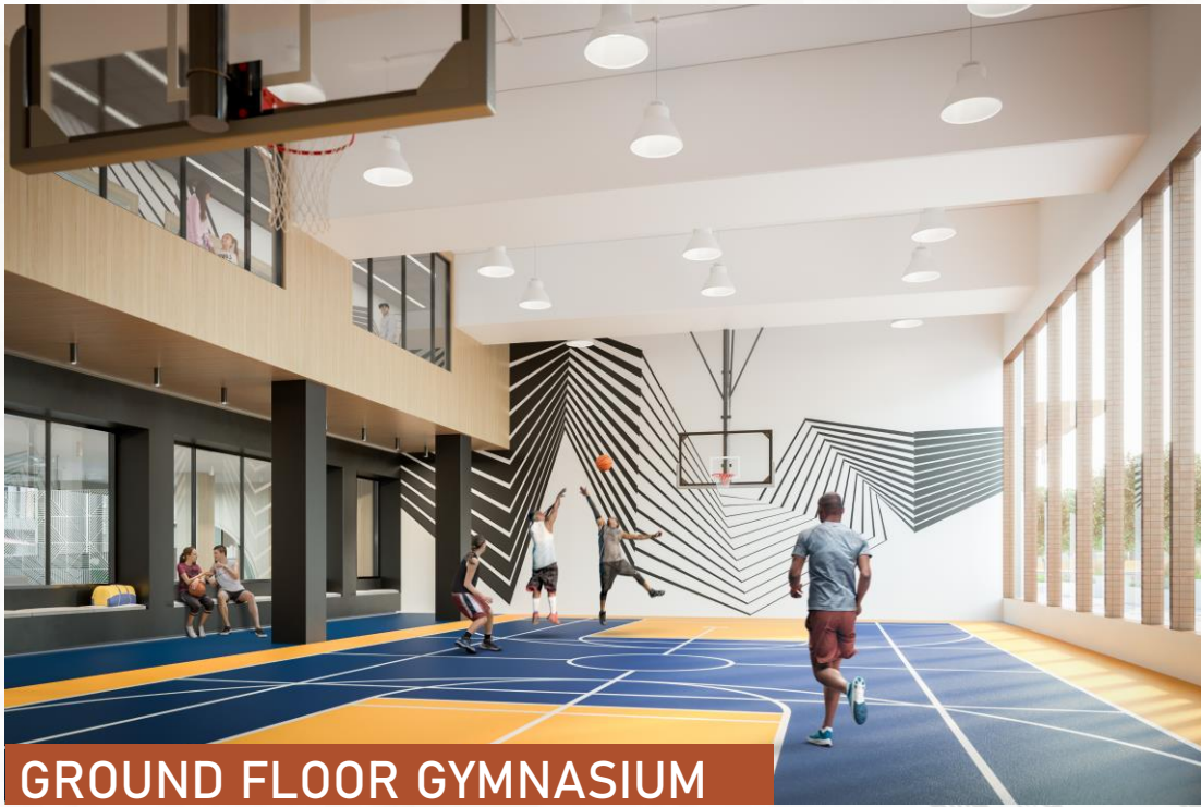
GROUND FLOOR GYMNASIUM