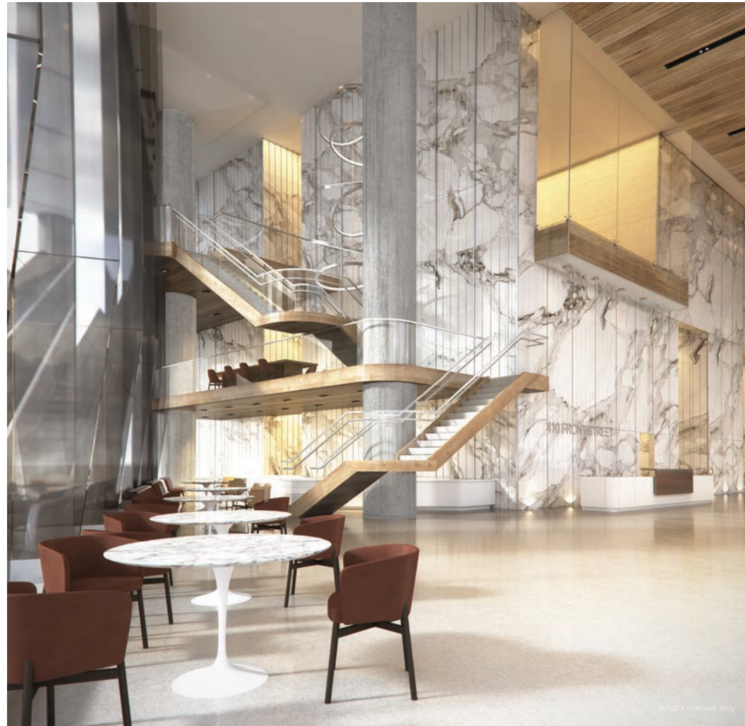
Artist's concept only

The offices at The Well will offer sophisticated workplace solutions, with over 1.1 million square feet of flexible space available for lease in one of the most inspiring professional hubs in Toronto. Targeting a LEED® Platinum certification, the offices at The Well can accommodate 6,000 workers with their evolving needs.