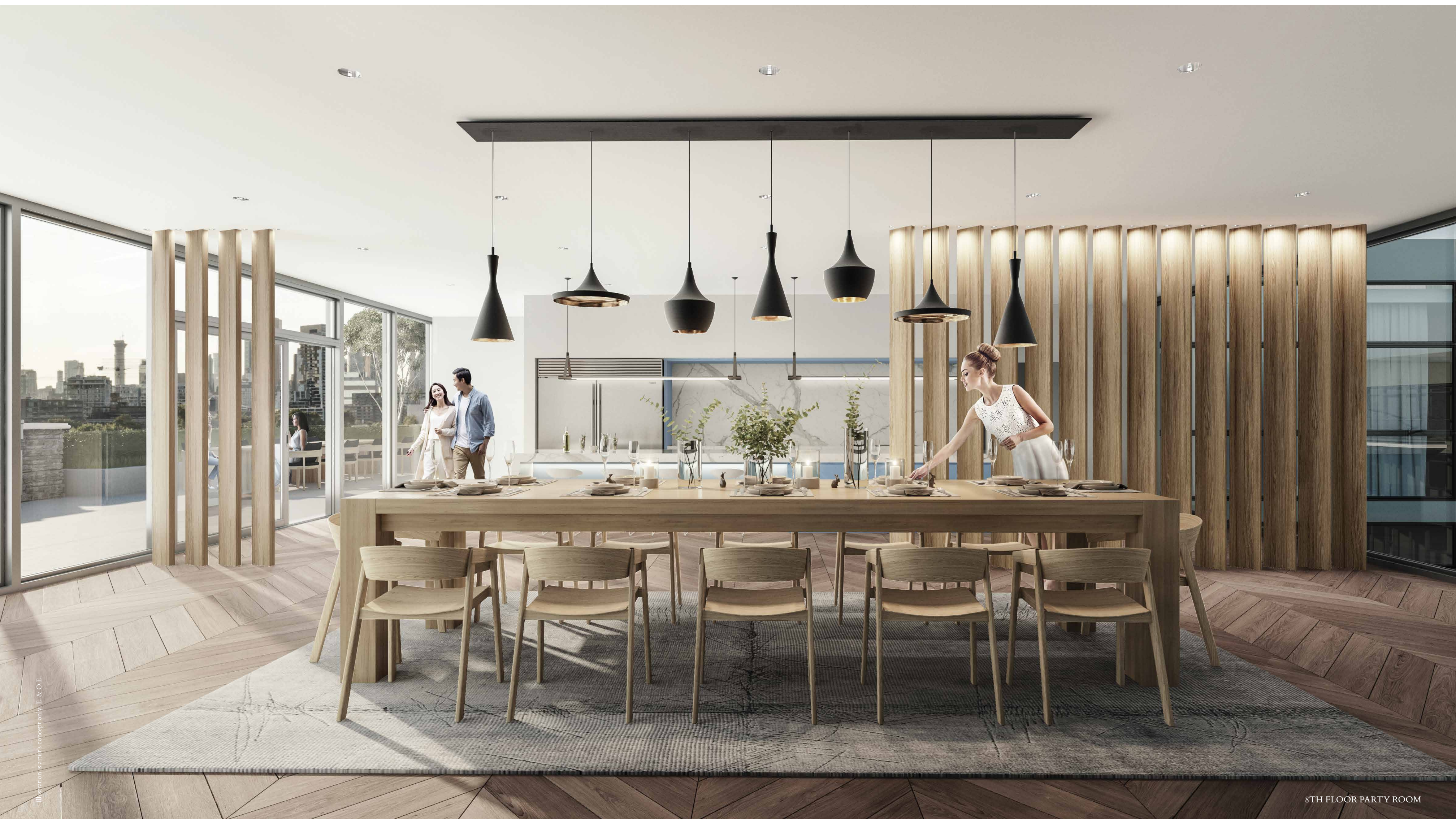
Illustration is artist's concept only. E. & O.E.