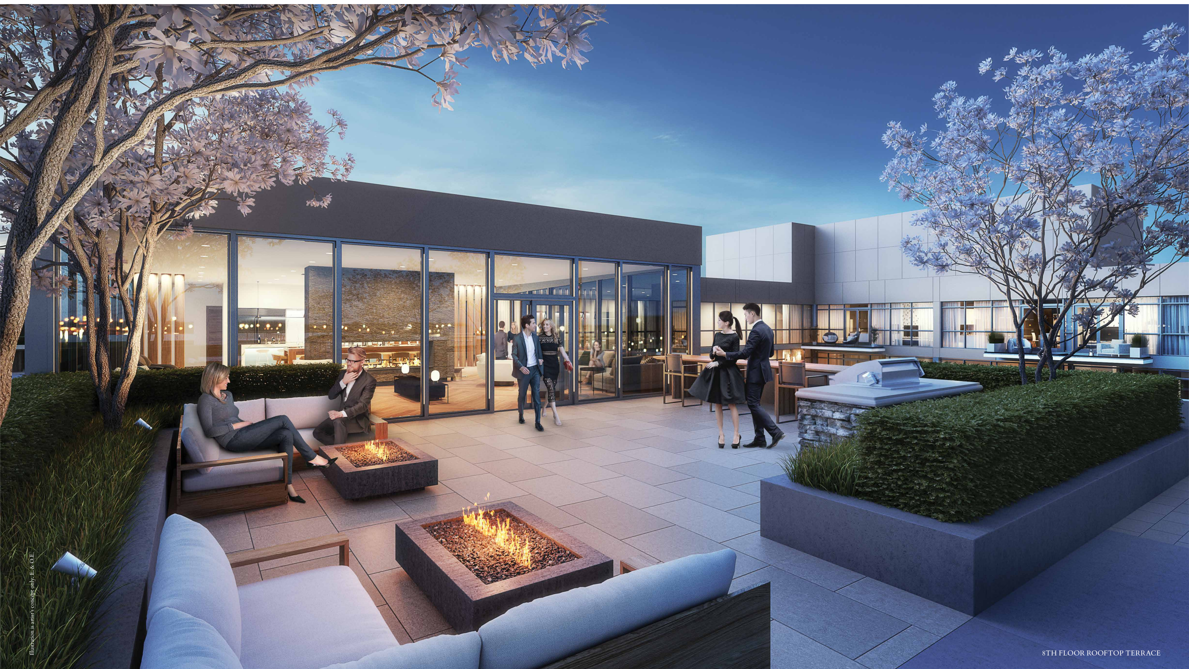
Illustration is artist's concept only. E & O.E.