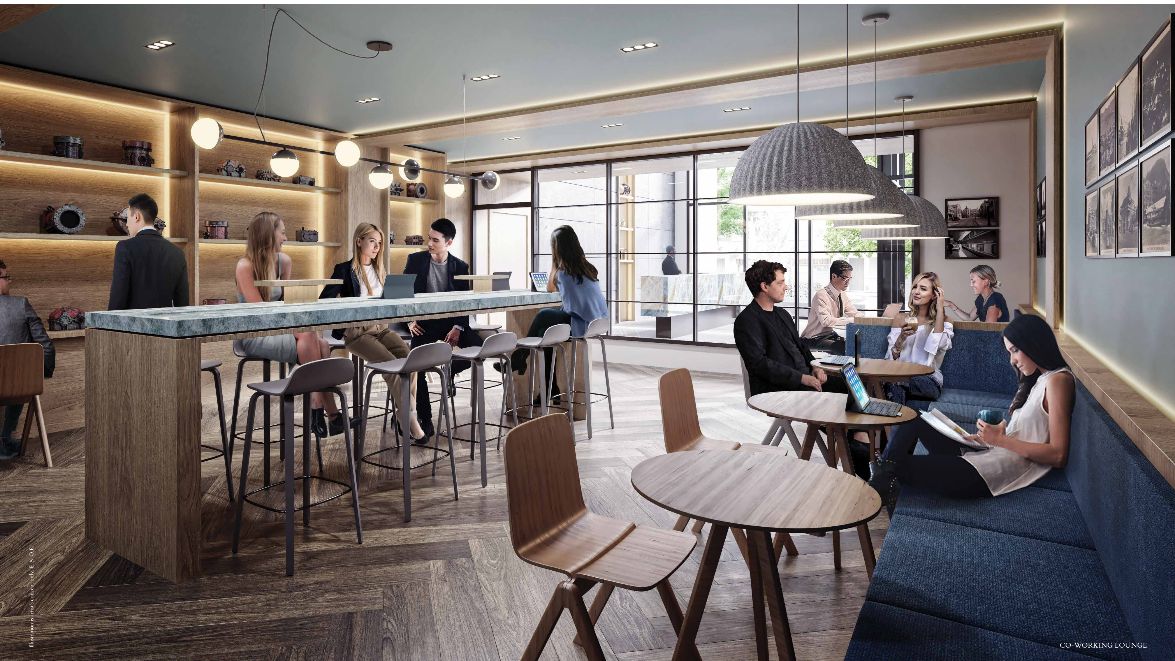
Illustration is a risk's concept only. E. & O.E.