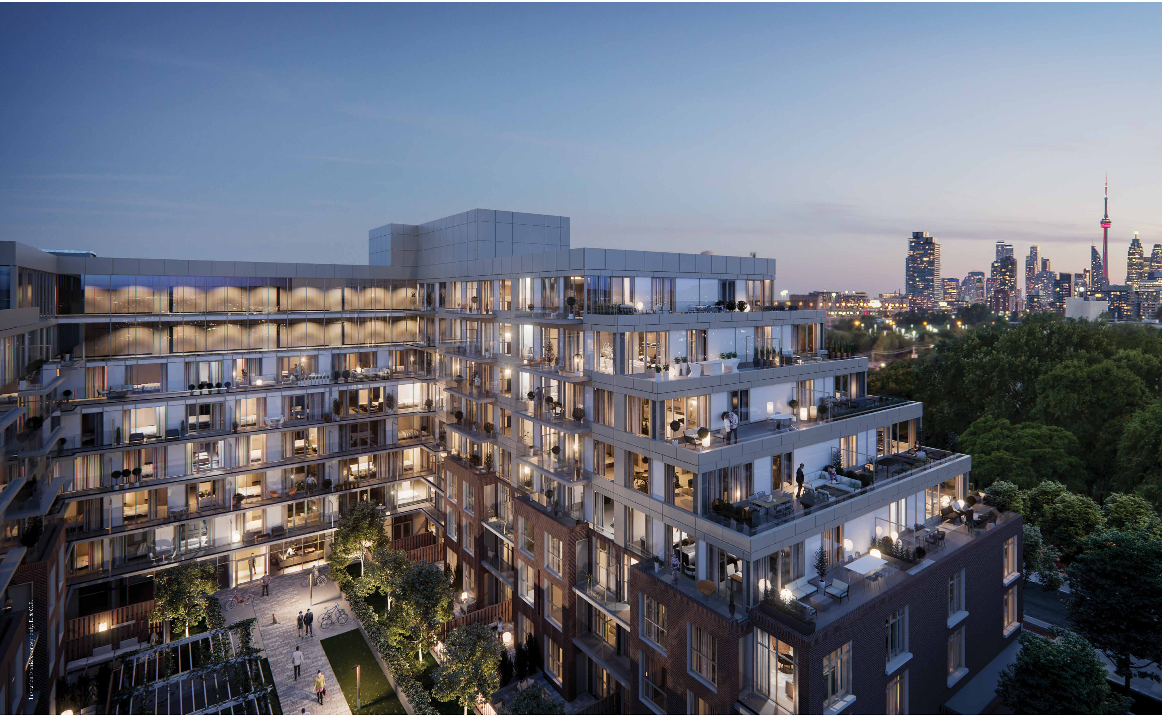
Illustration is artist's concept only. E. & O.E.