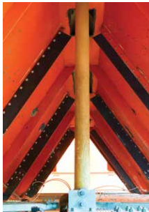
On the cover: Photograph by Laird Kay

[Artist's Statement] Buildings grow, learn, and adapt. They are organic. Just like the bread that was made, proofed, and baked here in this building, the factory is changing, and still has many stories to tell. The details of the equipment have been abstracted and are seen as sculpture, and as graphic design. This building is still a wonder. Wonder: a word that fills us with optimism, stimulates the imagination, and makes us aware of infinite possibilities.