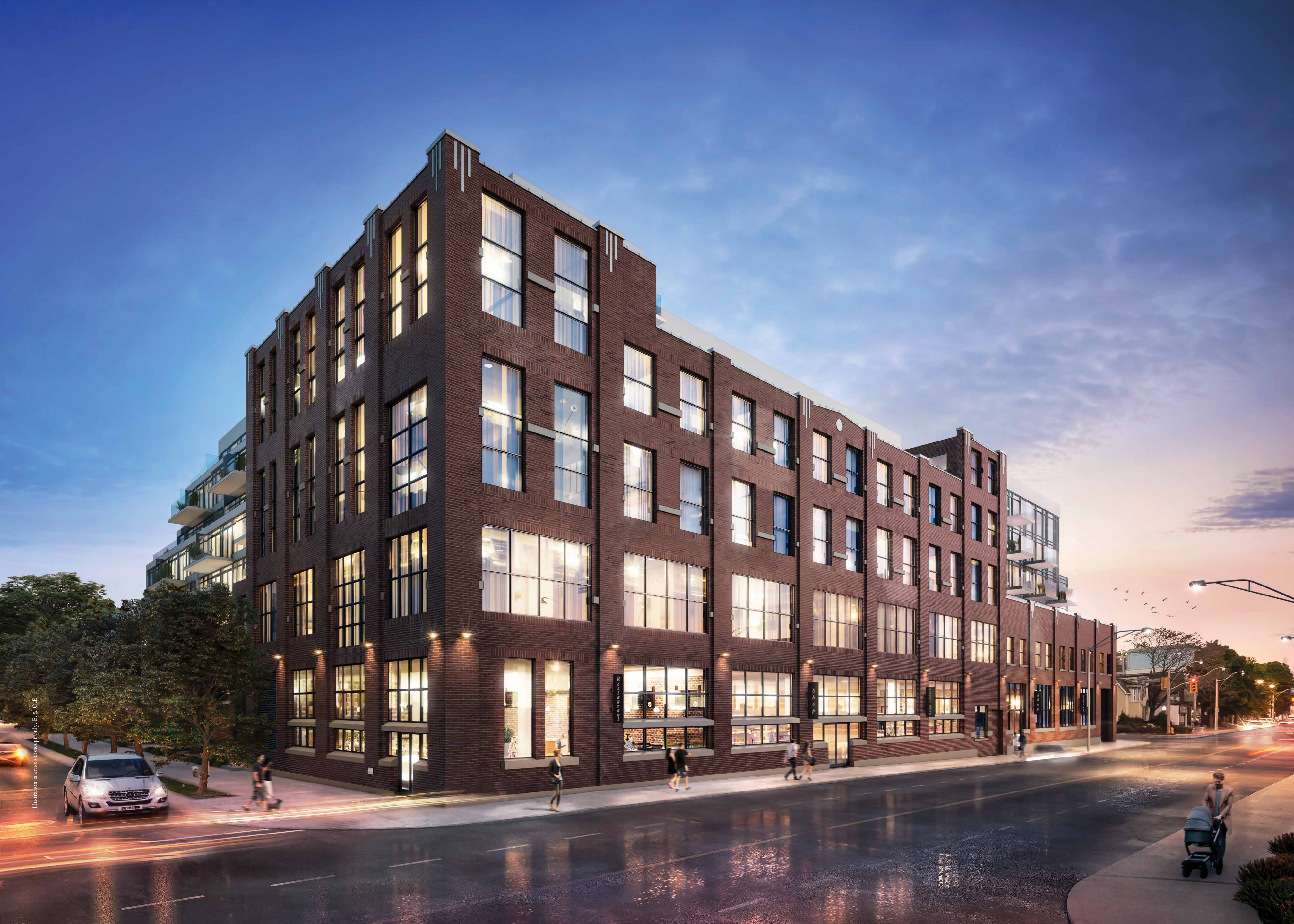
Illustration is artist's concept only. E. & O.E.