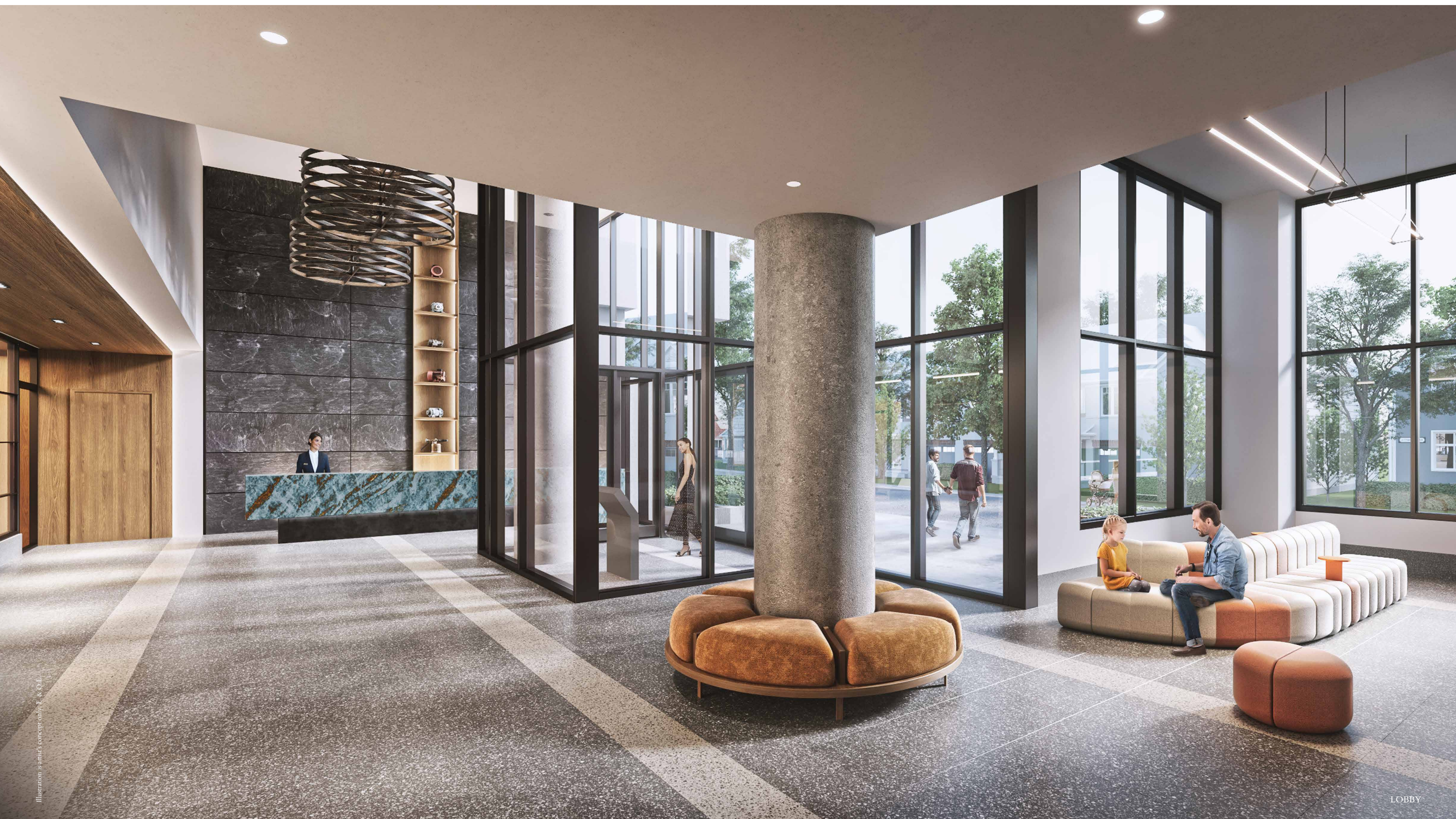
Illustration is artist's concept only. E. & O.L.