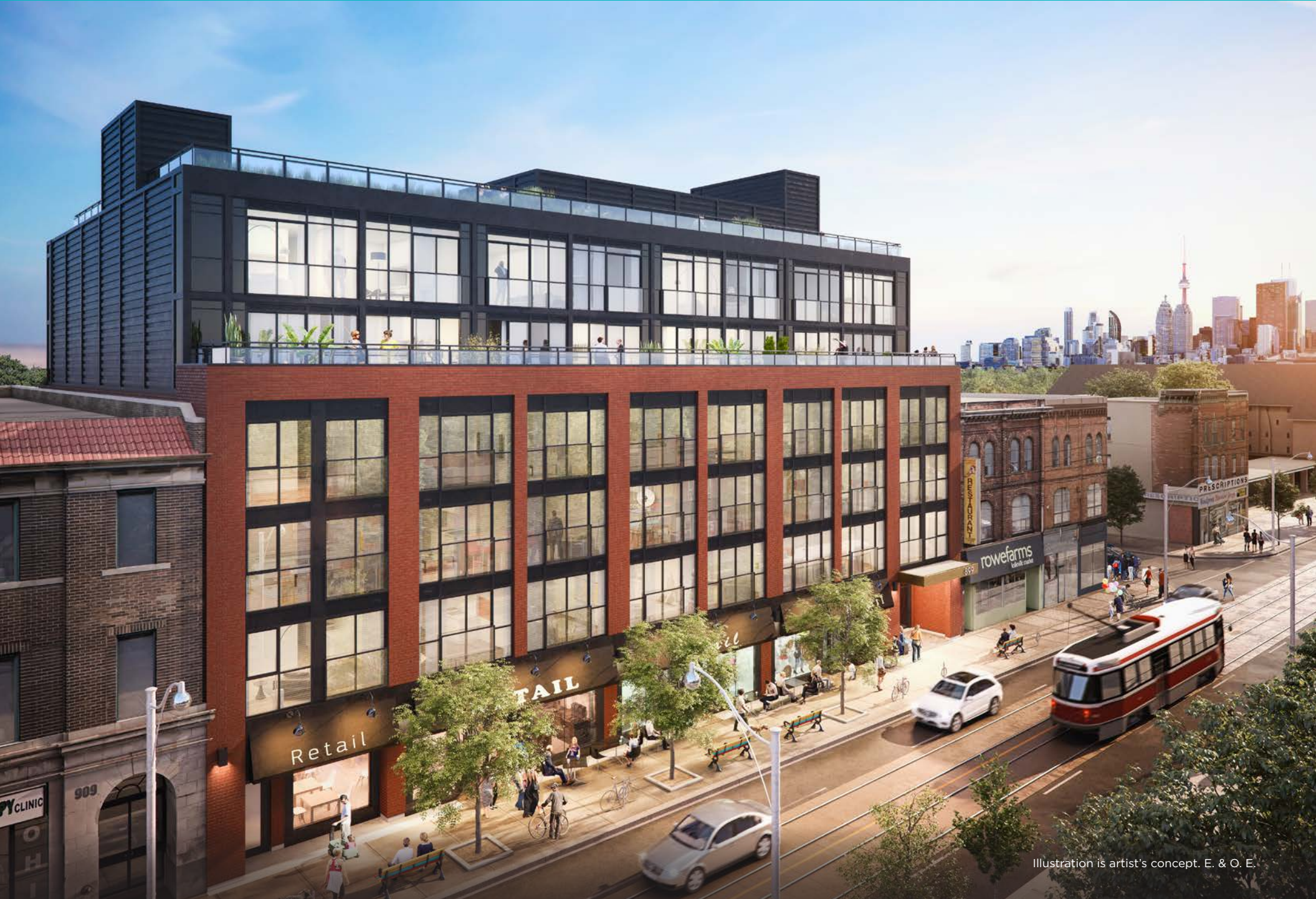
Illustration is artist's concept. E. & O. E.