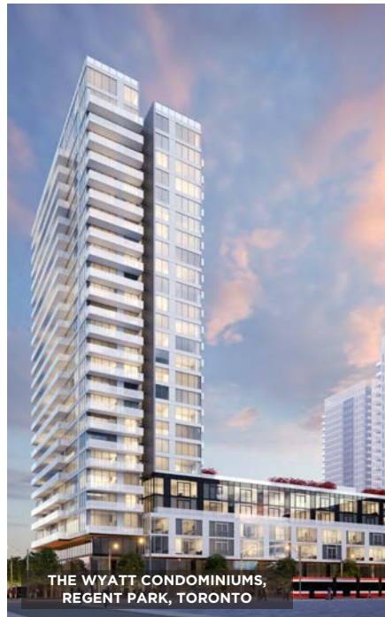
THE WYATT CONDOMINIUMS, REGENT PARK, TORONTO