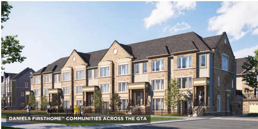
DANIELS FIRSTHOME™ COMMUNITIES ACROSS THE GTA