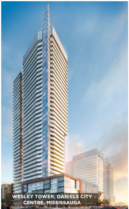
WESLEY TOWER, DANIELS CITY CENTRE, MISSISSAUGA