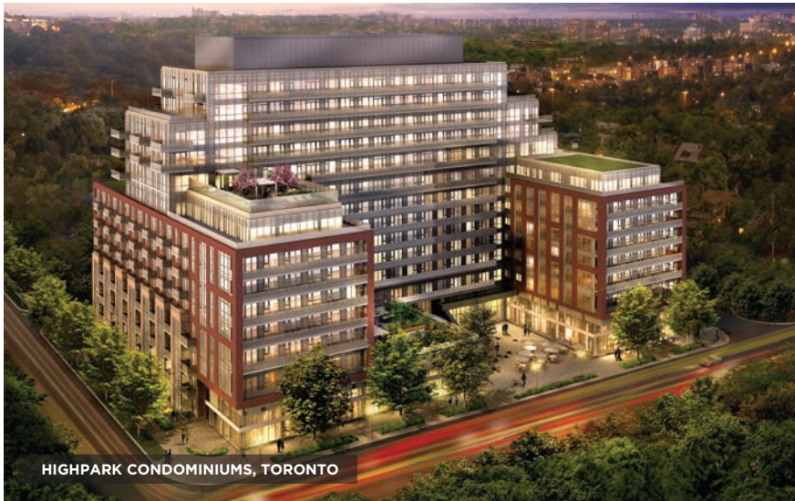
HIGHPARK CONDOMINIUMS, TORONTO