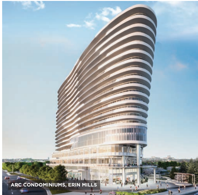
ARC CONDOMINIUMS, ERIN MILLS