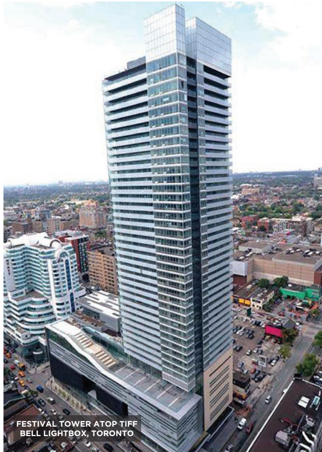
FESTIVAL TOWER ATOP TIFF BELL LIGHTBOX, TORONTO