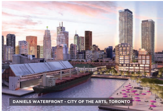
DANIELS WATERFRONT - CITY OF THE ARTS, TORONTO